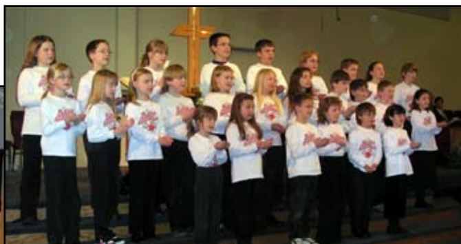
Children Thrive at St. Luke's! At left, children enjoy the Puppet Ministry during the PEAK Sunday School rotation "The Garden of Gethsemane." Above, the Children's Choir performs the prelude for the Sunday morning services on May 12th.