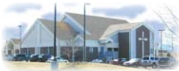
Highlands Ranch, Colorado