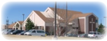
Highlands Ranch, Colorado