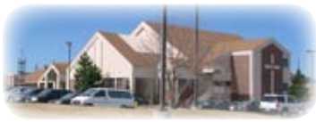
Highlands Ranch, Colorado