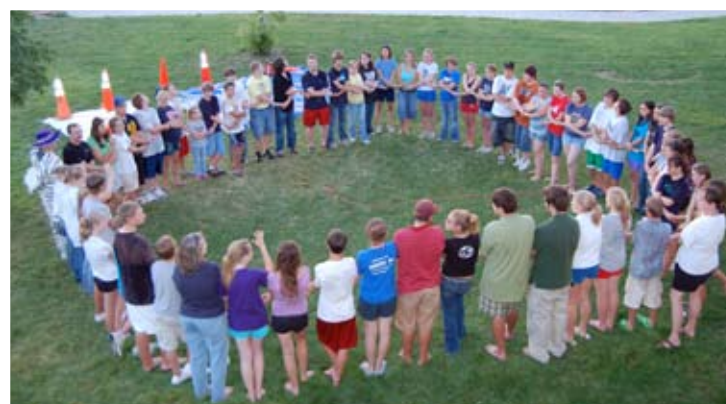
SLY PM Fellowship August 19, 2007.

So consider joining me on September 22! It will be a fun, educational and rewarding experience!