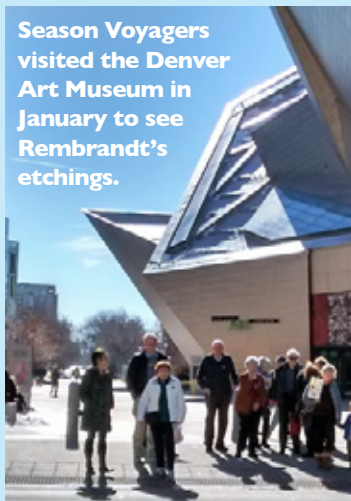
Season Voyagers visited the Denver Art Museum in January to see Rembrandt's etchings.

Do you have an idea for one of our monthly activities? Stop by our table in Fellowship Hall to share your ideas with us. We also have flyers about our upcoming events, sign up sheets and other info.