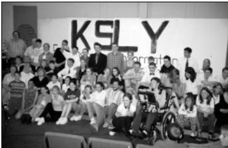
Over 60 youth took part in Youth Sunday services on April 9, 2000. SLY put on a great show and gave us all a new way to look at our lives as Christians through the SLY channel: KSLY.....and that is our final answer.