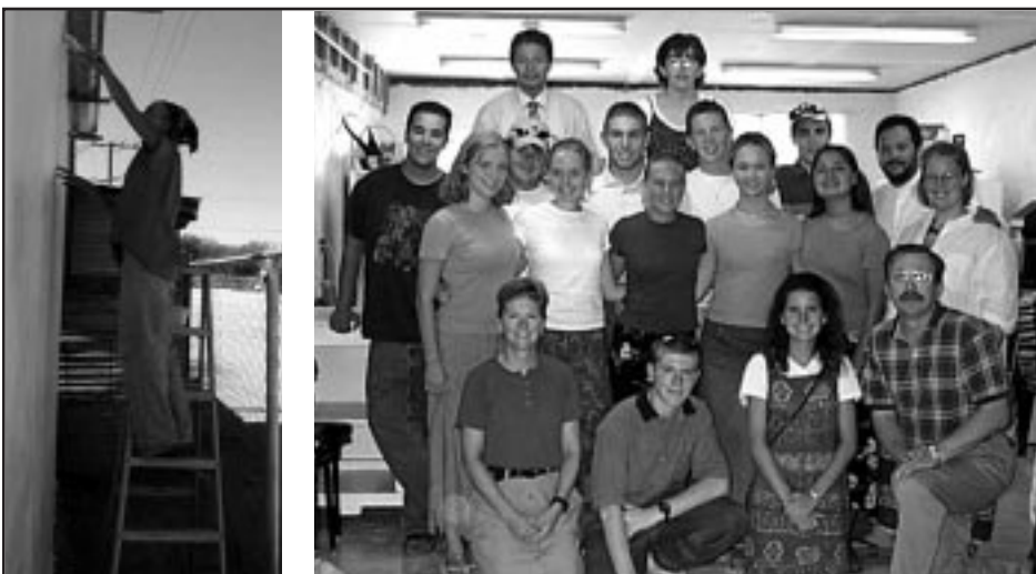
SLY Missions Trip to Mexico Yes, it was hot, but the 11 youth and 3 adults from St. Luke's had a memorable and spirit-filled week, July 9-16, doing missions work and making new friends in San Luis Rio de Colorado, Mexico. Details to come in our next issue.