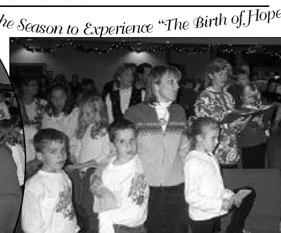
'Tis the Season to Experience "The Birth of Hope" Carols and Cookies! St. Luke's Annual Tree Lighting Ceremony was a chance for us to enjoy time together to reflect on the beginning of the Advent season and prepare for the Birth of Hope.