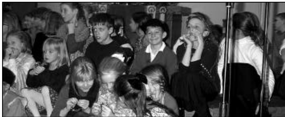
Our 'kidz' relax after their terrific performance in "Why the Chimes Rang."

We hope you come to this interesting and informative event. Bring your calendars and your children, too!