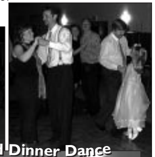
Big Band Dinner Dance