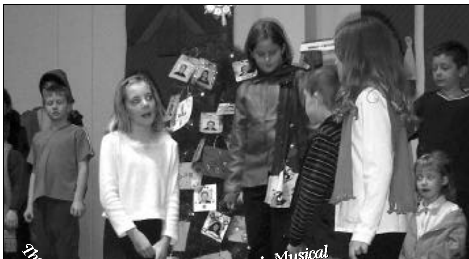
The Christmas Family Tree Children's Musical

I would say that we have progressed as we have aged. We still do pretty much the same things we did when it all got started. We are very proud to be a part of such a dynamic group of Christian friends who do their best to be invitational, relational and missional.