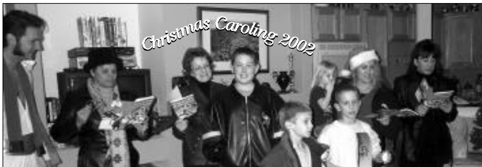
Christmas Caroling 2002

All proceeds benefit the Music Ministry program at St. Luke's.