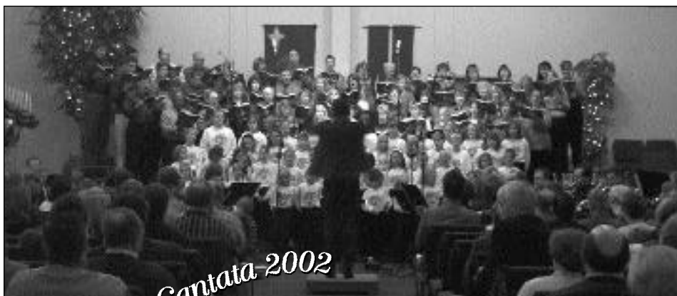
Christmas Cantata 2002