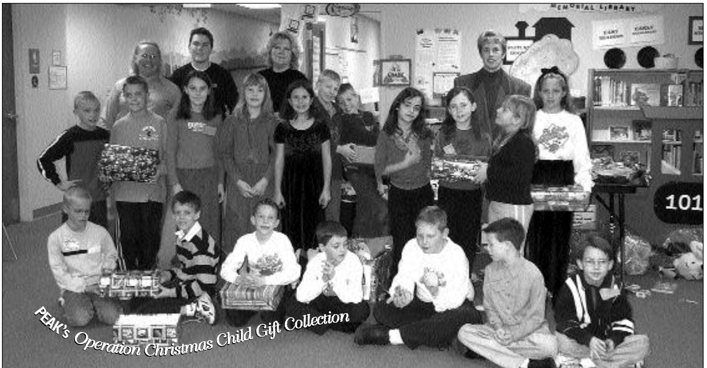
PEAK's Operation Christmas Child Gift Collection