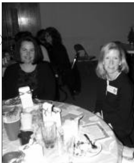
UMW Candlelight Dinner