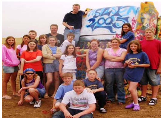
Scenes from the Jr. High Mission Experience

Breakfast Club Thursday mornings from 10 – 11 am at Einstein's on HR Pkwy & Broadway.