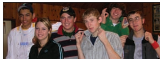
We had a blast at last year's ski retreat in Steamboat. Will you make this year's trip even better?