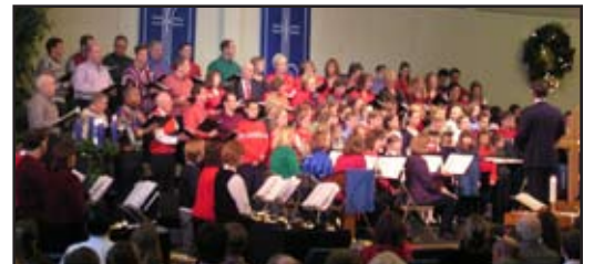
The Christmas Cantata featured over 150 musicians.

Eat, Dance and be merry at St. Luke's Annual Dinner Dance. Join in the fun and the tradition! Tickets will be available beginning February 12th. The cost for Dinner and the Dance will be $15 per person. Proceeds benefit the music program.