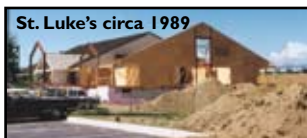
St. Luke's circa 1989