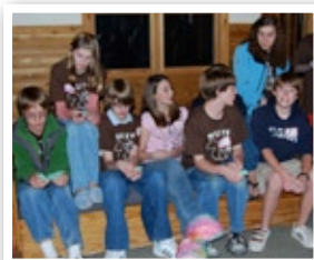
Nov. 16-18 It was Nuts!