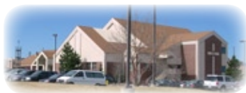
Highlands Ranch, Colorado