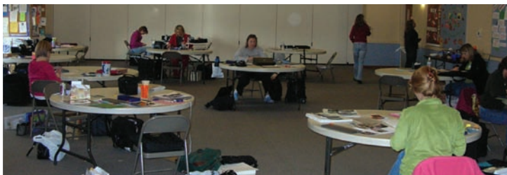
Crop for the Cure, held Nov. 11, 2006 at St. Luke's, raised $260 for the Susan G. Komen Fund. Several ladies would like to do it again in the spring and make it a 2 time a year event. Lots of album pages were completed, ideas shared, and fun had by the 13 ladies who attended. It was a great time with friends both new and old.