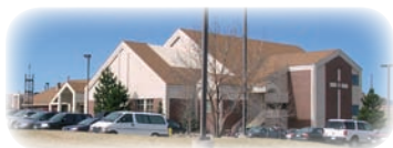
Highlands Ranch, Colorado