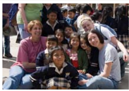
John Wesley School in Santa Cruz del Quiche