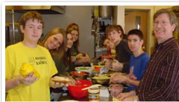
Making Super Bowl subs to raise money for missions.