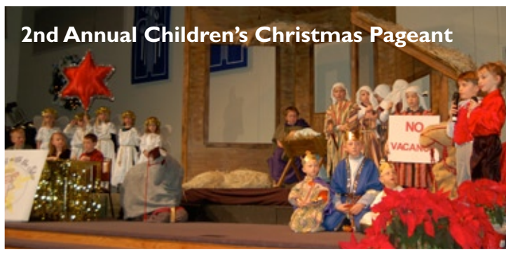
2nd Annual Children's Christmas Pageant