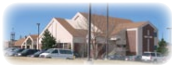
Highlands Ranch, Colorado