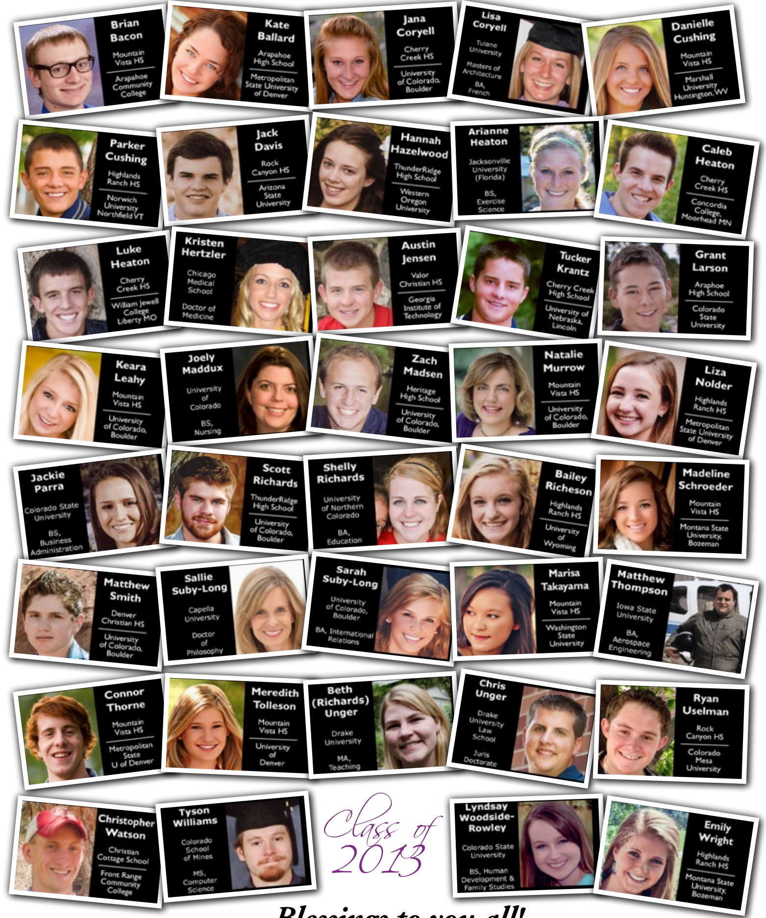
Blessings to you all! Your St. Luke's family is so very proud of you!