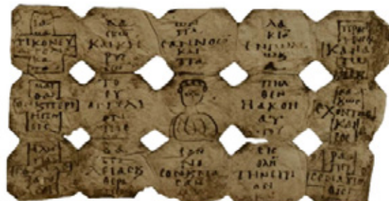
6th C Christian Amulet excavated at the site of ancient Oxyrhynchus, Egypt